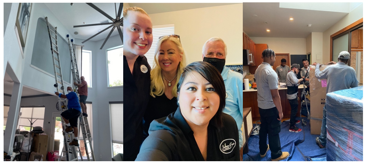
White Glove Installation of the Property: We Do All the Work

(Designer and team will completely install and stage property. For properties under 4,000 square feet this is generally a ONE DAY install. Larger Properties may require a two-day installation. All properties must be cleaned and construction completed prior to our arrival. Our team will handle everything, and we "leave no trace". All trash will be hauled off, and the home will be clean and swept, and ready to rent.